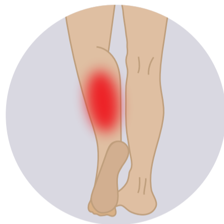
E XCESSIVE REDNESS